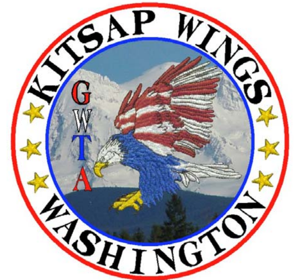
Kitsap Wings GWTA WA Chapter K